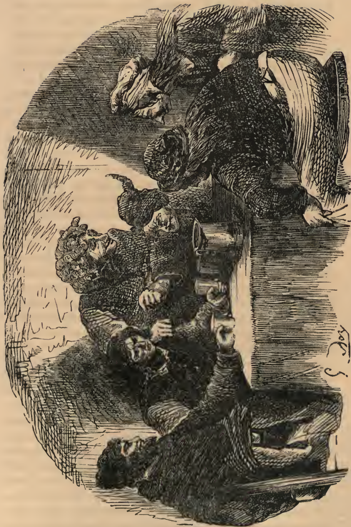
The good man disputed himself with other rogues playing with his three dice